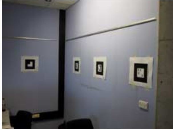
Figure 4: Fiducial marker on the wall

that they would be usable by the system regardless of whether the user was very close or very far from the wall. In this case, we chose to use patterns that were a size of 19\text{ cm}^2 . From testing, we found that the system could register a pattern at a range of 22.5\text{ cm} to 385\text{ cm} from the wall. In a 8 \times 7\text{ m} room this range would be sufficient (for the initial stages of the project) and an accuracy of within 10\text{ cm} at the longer distances. It is important that no matter where the user looks in the room that, at least one pattern must be visible in order to provide tracking. For this reason, we realised that to implement the patterns on the walls as the sole means of tracking would require different size targets. We are investigating the use of targets themselves as patterns inside larger targets; therefore one large target may contain four smaller targets when a user is close to a target.