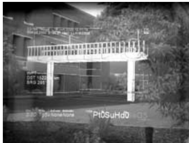
Figure 5: Proposal One Bridge

As a second application domain for the use of our outdoor AR system, we are investigating how to improve the visualisation of architecture designs. The first question to ask is – Why an architect may use this tool? An AR visualization tool will aid architects in conveying their ideas to their prospective clients. A common