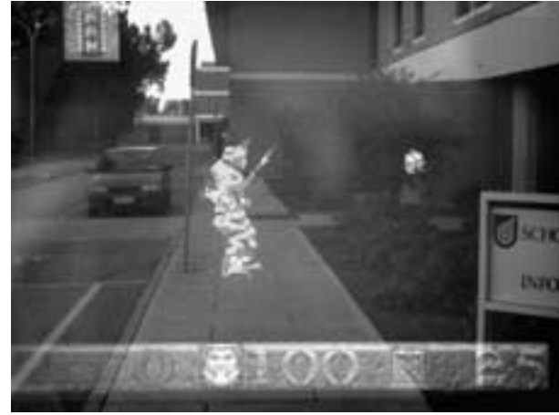
Figure 2: User’s Heads Up Display

The tracking of the user’s position and orientation of the user’s head handles the majority of the interaction