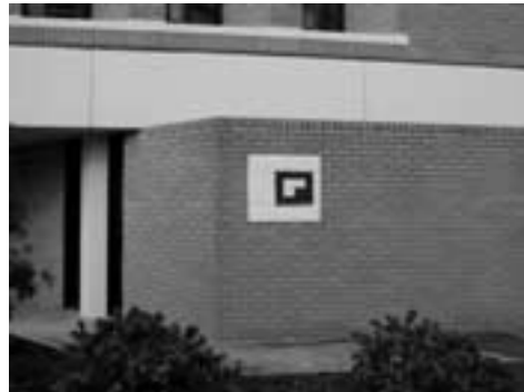
Figure 3: Fiducial marker on a building

When using ARQuake with the GPS/compass tracking less than 50 metres from a building, the poor occlusion of monsters and objects near the physical buildings, due to GPS error, becomes more apparent. As the user moves closer to buildings, inaccuracies in GPS positional information become prevalent. The system is now required to slave the Quake world to the real world, and furthermore in real time. As an example when a user is ten metres from a building their position is out by 2-5 metres, this equates to an error of 11-27 degrees; this is approximately a half to the full size of the horizontal field of view of the HMD. When the error is greater than the horizontal field of view, the virtual object is not visible on the HMD.