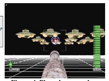
Figure 4. Player's gun and an approaching fleet of UFOs