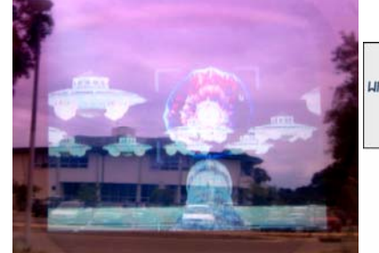
Figure 2. Photo of the Sky Invaders 3D game