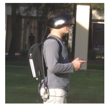
Figure 1. Outdoor AR game hardware

2.1.1 Indoor AR Games . An early example of an indoor AR game is AR Mahjong (Szalavari 2002) that allows for multiple people to play a virtual game of Mahjong. AquaGauntlet (Tamura 2001) is a multiplayer game where users wear a video see-through HMD and shoot monsters in a room. When players observe their teammates they appear with an augmented helmet and gun. AquaGauntlet was based on an earlier version called RV-Border Guards (Ohshima 1999). AR2Hockey (Ohshima 1998) allows two players to sit at a regular table wearing HMDs and hold physical mallets. These mallets allow